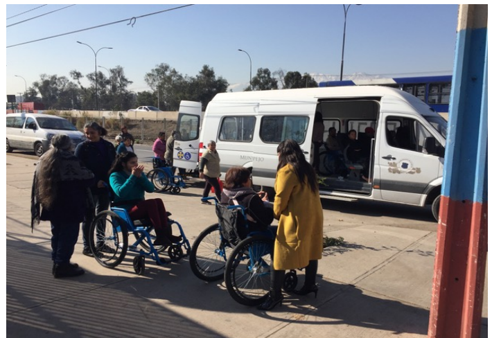
Sharing a snack together, after the municipalities brought a van to take them all home