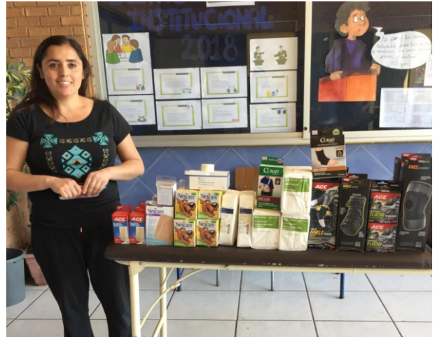
CONAF's Team (Corporación Nacional Forestal)