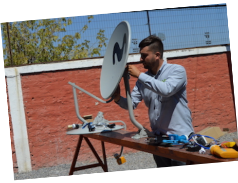
Evaluation of work on Satellite Antena