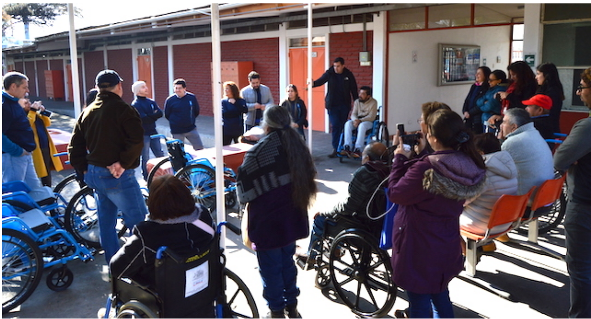
Sharing a magical moment with the people receiving the wheelchairs