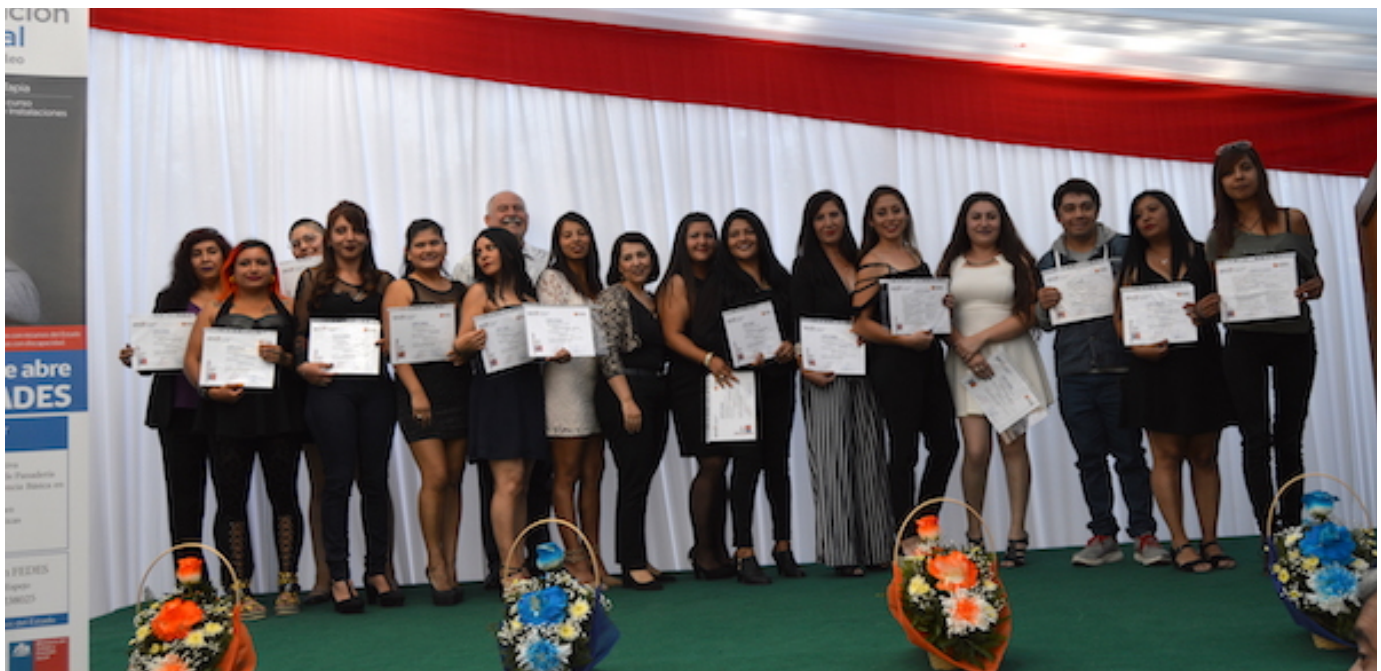
Students from the Tailoring course getting their Diplomas.