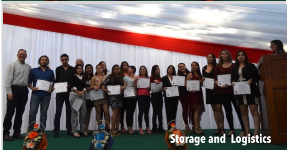
Storage and Logistics