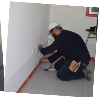
Photos of practical installations during the certification examinations