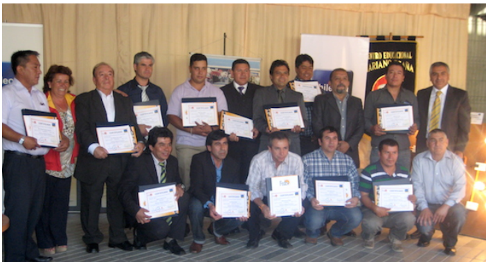
CERTIFICATION OF THE DOMICILIARY POWER FACILITIES COURSE.

The Endesa Foundation is developing a program in collaboration with several NGOs, to develop training activities for people with few resources or social marginality problems to obtain employment, this being key to sustainable social integration.