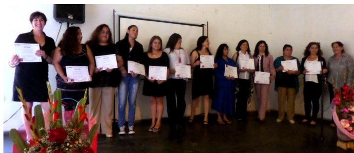
Care of Sick and Elderly Course & Baking and Pastry Course