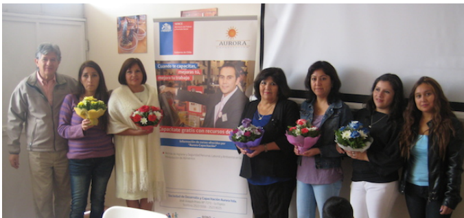
CERTIFICATION OF THE “STANDARDS OF HYGIENE AND PERSONAL SECURITY IN OCCUPATIONAL AND ENVIRONMENTAL FOOD HANDLING” COURSE.

The Endesa Foundation asked FEDES for the design and implementation of the course “Domiciliary Power Facilities” of 250 hours. The implementation of this course was held in the Liceo Mariano Egaña of the commune of Peñalolen, in evening hours, all the participants were over 18 and all families of students of that School.