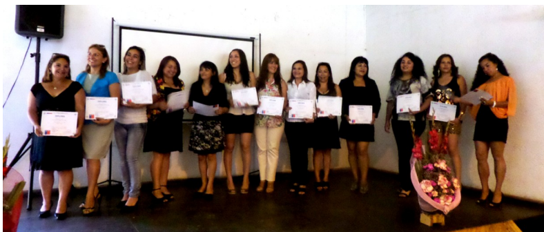
Integral Aesthetics Course