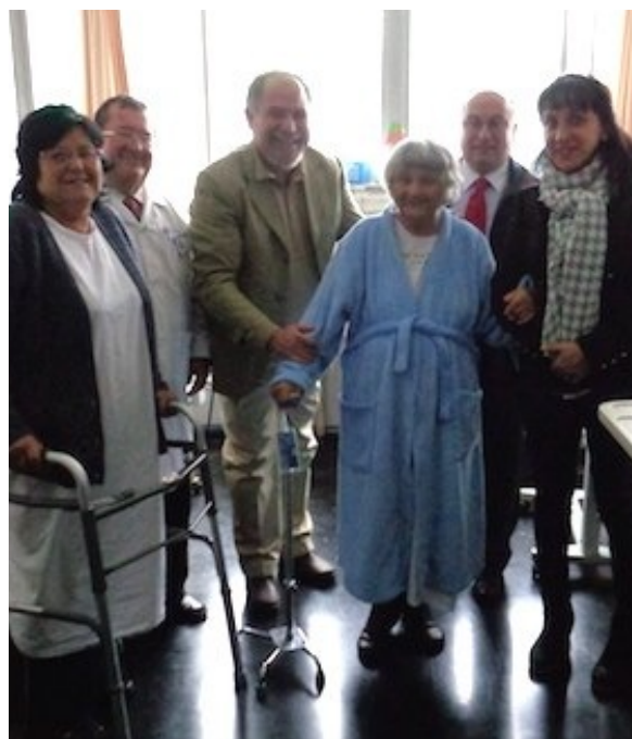
Picture (left). Visit to dialysis ward, where walkers were donated to the patients.